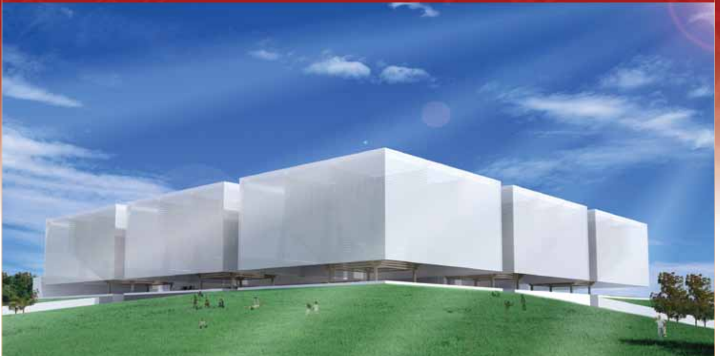
Honorable Mention • Ar Ang Wen Hsia & Ar Ang Boo Chung of Building Bloc Architects