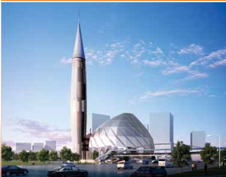
Finalist • Spatial Design