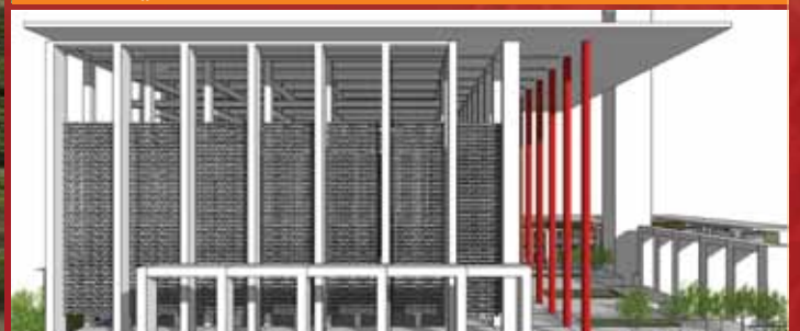
Finalist • HMA & Associates