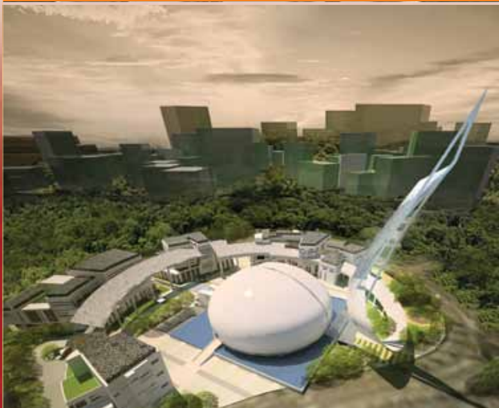
Finalist • ARC Partnership