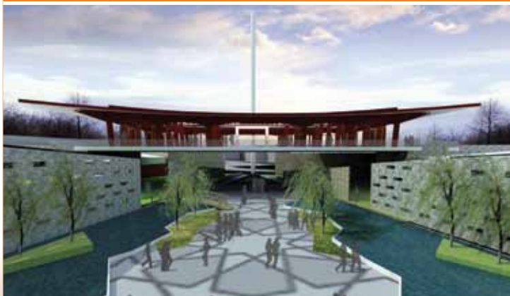
Finalist • Veritas Architects Sdn Bhd