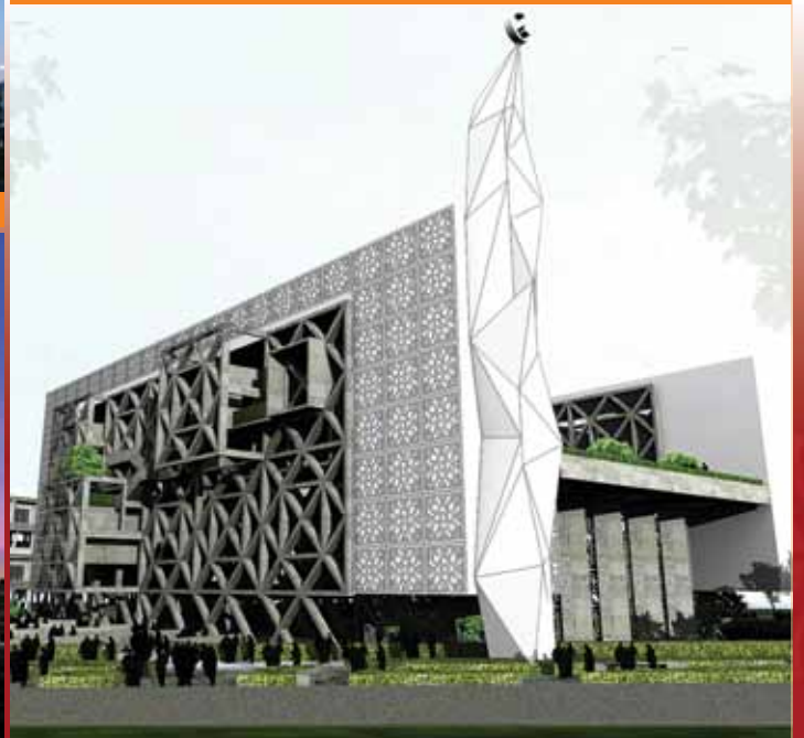
Finalist • Razin Architect