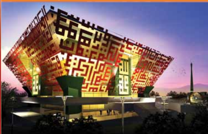
Finalist • ATSA Architects Sdn Bhd