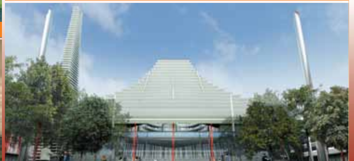
Finalist • Hijjas Kasturi Associates