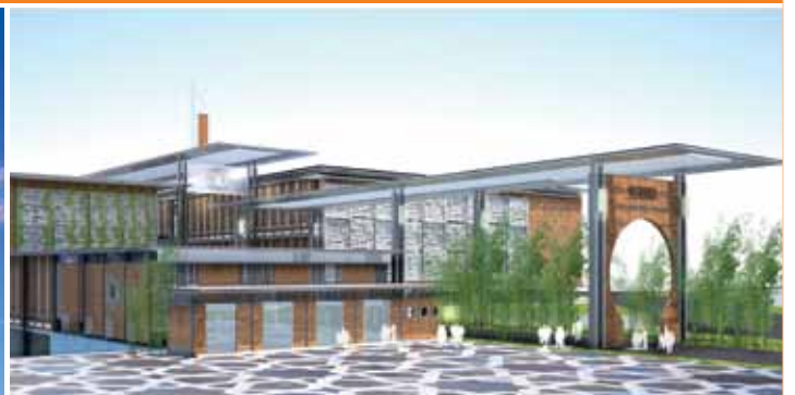
Finalist • BCT Arkitek