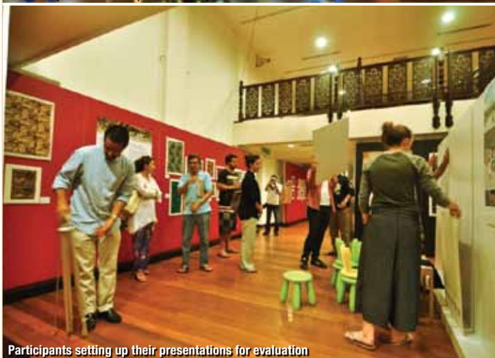
Participants setting up their presentations for evaluation