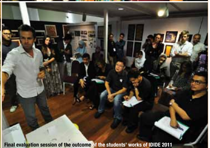
Final evaluation session of the outcome of the students’ works of IDIDE 2011