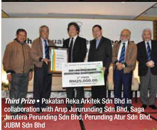
Third Prize • Pakatan Reka Arkitek Sdn Bhd in collaboration with Arup Jururunding Sdn Bhd, Saga Jurutera Perunding Sdn Bhd, Perunding Atur Sdn Bhd, JUBM Sdn Bhd