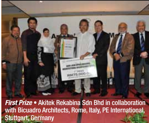
First Prize • Akitek Rekabina Sdn Bhd in collaboration with Bicuadro Architects, Rome, Italy, PE International, Stuttgart, Germany