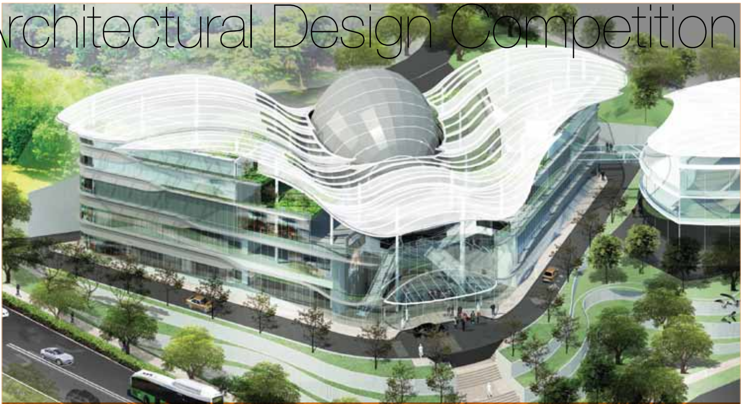
Third Prize • Pakatan Reka Arkitek Sdn Bhd in collaboration with Arup Jururunding Sdn Bhd, Saga Jurutera Perunding Sdn Bhd, Perunding Atur Sdn Bhd, JUBM Sdn Bhd