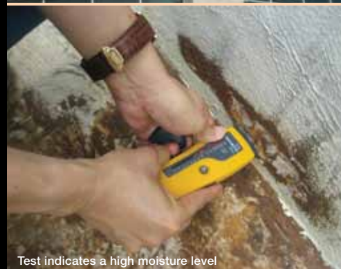
Test indicates a high moisture level