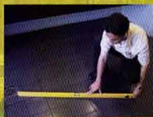
Checking fall of floor in wet areas