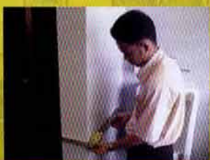
Checking squareness of internal wall

CIS 7 also specifies the sampling guideline and the weightage allocated for each component according to the category of building.