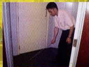
Checking hollowness of tiled floor