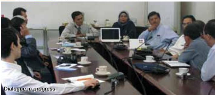
Dialogue in progress