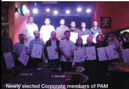
Newly elected Corporate members of PAM