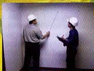
Checking hollowness of internal wall