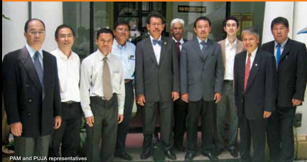
PAM and PUJA representatives

11 February 09 • PAM Centre, Kuala Lumpur