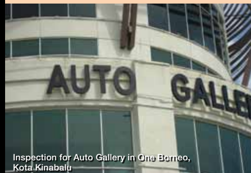
Inspection for Auto Gallery in One Borneo, Kota Kinabalu

The client is engaging Architect Centre to conduct a complete building inspection before taking vacant possession of the property. Ar Sim Sie Hong and Ar Ho Jia Lit have taken up the challenge to inspect their first project. The inspection was done on 24 December 2008 and later to re-inspect on 6 January 2009. The report is being compiled for the client and shall be ready within two weeks after the final checking and editing from Architect Centre in Kuala Lumpur to ensure the quality and consistency of the reporting format.