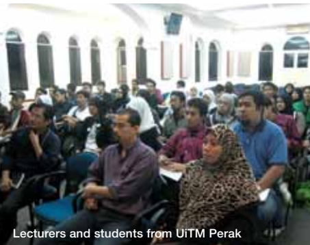
Lecturers and students from UiTM Perak

UiTM Perak Academic Visit to PAM PAM Centre, KL