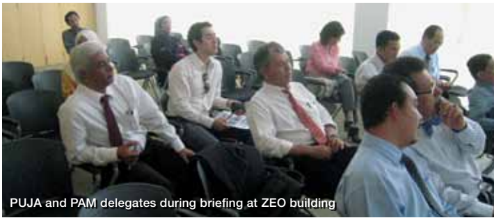
PUJA and PAM delegates during briefing at ZEO building