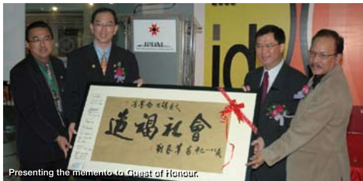
Presenting the memento to Guest of Honour.