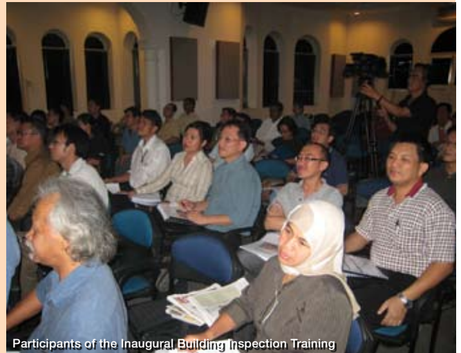
Participants of the Inaugural Building Inspection Training