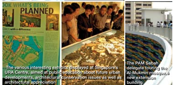
The various interesting exhibits displayed at Singapore's URA Centre, aimed at public education about future urban developments, architectural conservation issues as well as architectural appreciation