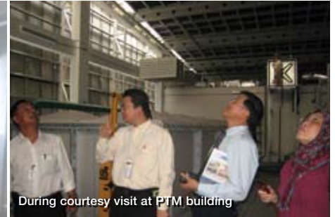
During courtesy visit at PTM building