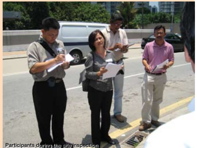
Participants during the site inspection