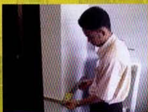
Checking squareness of internal wall

CIS 7 also specifies the sampling guideline and the weightage allocated for each component according to the category of building.