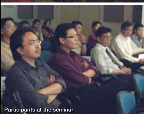
Participants at the seminar