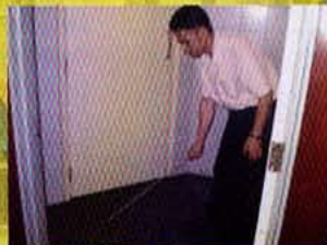
Checking hollowness of tiled floor