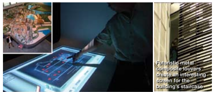
Futuristic metal composite louvers create an interesting screen for the building's staircase

PAM Sabah Chapter expressed appreciation for the assistance and hospitality from SIA on the group's enjoyable and enlightening visit to Singapore.