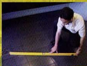
Checking fall of floor in wet areas