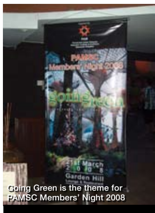
Going Green is the theme for PAMSC Members' Night 2008

Members and their guests also had plenty of fun and laughter watching and taking part in the various games during the evening with lots of prizes and lucky draws being given out. On top of these, there was also a live band and best costume contests to entertain the crowd.