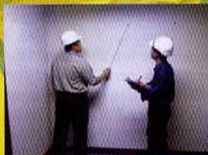
Checking hollowness of internal wall