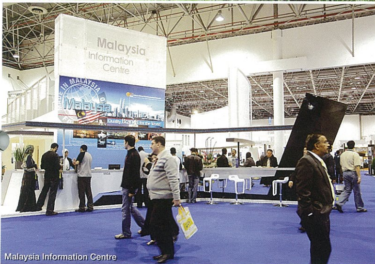
Malaysia Information Centre