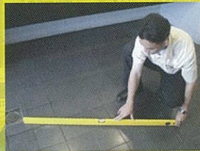
Checking fall of floor in wet areas