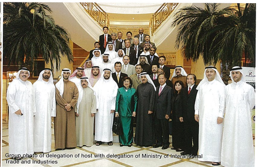
Group photo of delegation of host with delegation of Ministry of International Trade and Industries