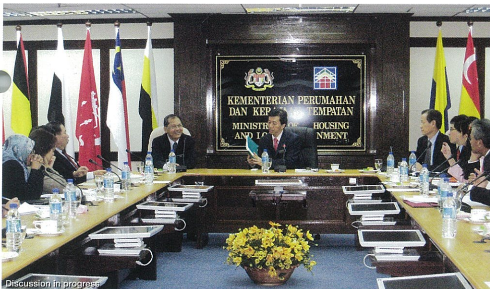
Discussion in progress