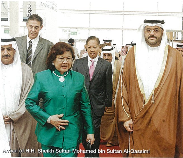
Arrival of H.H. Sheikh Sultan Mohamed bin Sultan Al-Qassimi