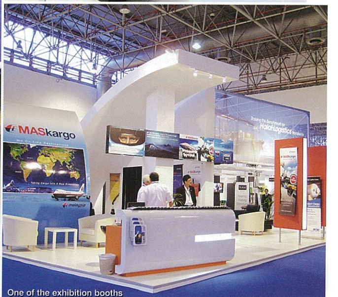
One of the exhibition booths