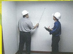
Checking hollowness of internal wall