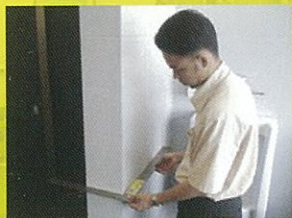
Checking squareness of internal wall

CIS 7 also specifies the sampling guideline and the weightage allocated for each component according to the category of building.