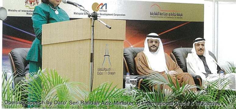
Opening speech by Dato' Seri Rafidah Aziz - Minister of International Trade & Industries