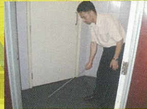
Checking hollowness of tiled floor