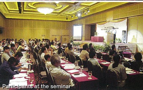
Participants at the seminar