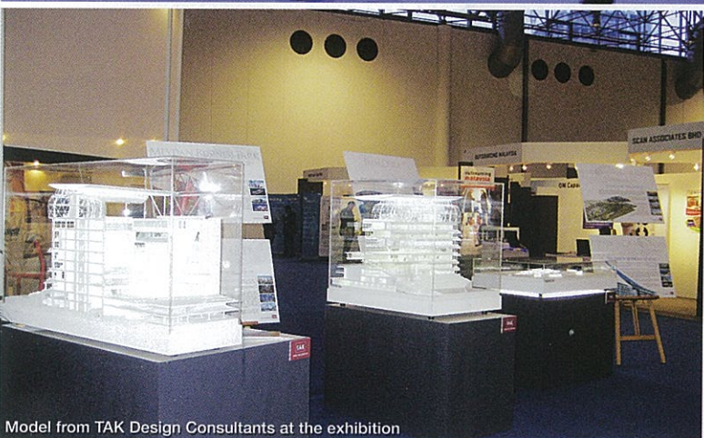
Model from TAK Design Consultants at the exhibition