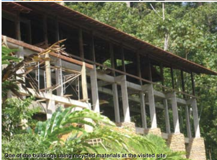
One of the buildings using recycled materials at the visited site

The seminar was held successfully on 28 – 29 August 2008 at The Legend Hotel Kuala Lumpur with participations of 400 Architects, Local Authorities, Government Departments and agencies, engineers, planners, developers, academicians, students and public. An exhibition to display 25 panels of works and sketches on interpretations of “Tropical Architecture” was also held concurrently with the seminar. The seminar was co-organised by PAM and DBKL to create an understanding on “tropical architecture” and to come up with the basis of guidelines for Kuala Lumpur’s development as outlined in the Kuala Lumpur Structure Plan 2020.