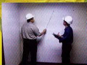
Checking hollowness of internal wall