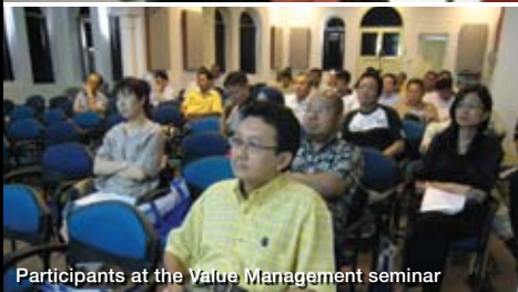
Participants at the Value Management seminar