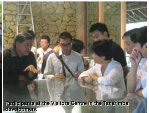
Participants at the Visitors Centre in the Tanarimba development