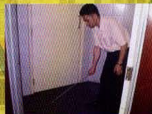
Checking hollowness of tiled floor