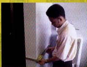
Checking squareness of internal wall

CIS 7 also specifies the sampling guideline and the weightage allocated for each component according to the category of building.