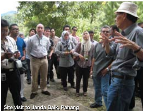
Site visit to Janda Baik, Pahang