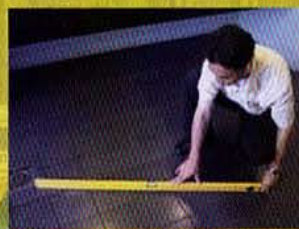
Checking fall of floor in wet areas