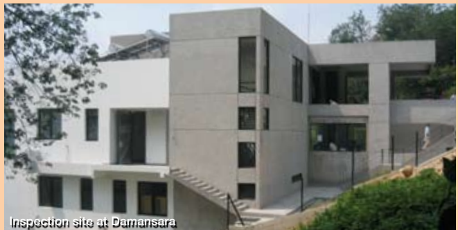
Inspection site at Damansara