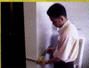
Checking squareness of internal wall

CIS 7 also specifies the sampling guideline and the weightage allocated for each component according to the category of building.