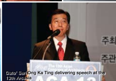
Dato' Seri Ong Ka Ting delivering speech at the 13th Arcasia