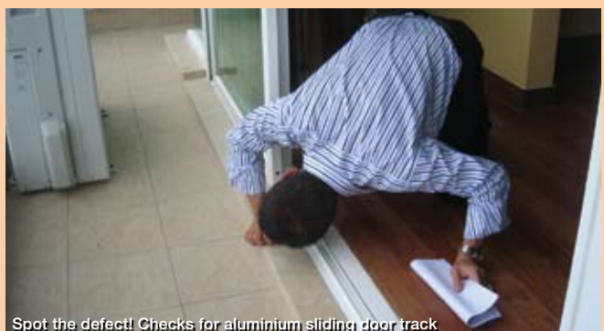
Spot the defect! Checks for aluminium sliding door track