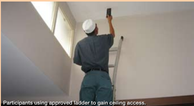
Participants using approved ladder to gain ceiling access.