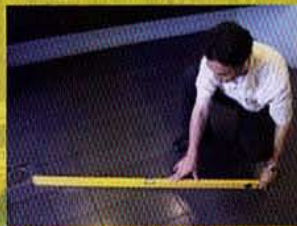
Checking fall of floor in wet areas