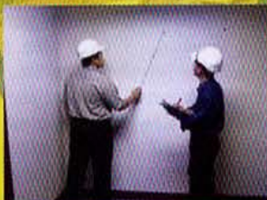
Checking hollowness of internal wall