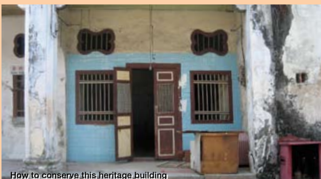
How to conserve this heritage building

The Northern Chapter architects were put into two contrasting challenges – a 100 year old completely dilapidated pre-war house and a high-end condominium near the coast.