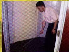
Checking hollowness of tiled floor