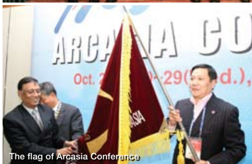
The flag of Arcasia Conference