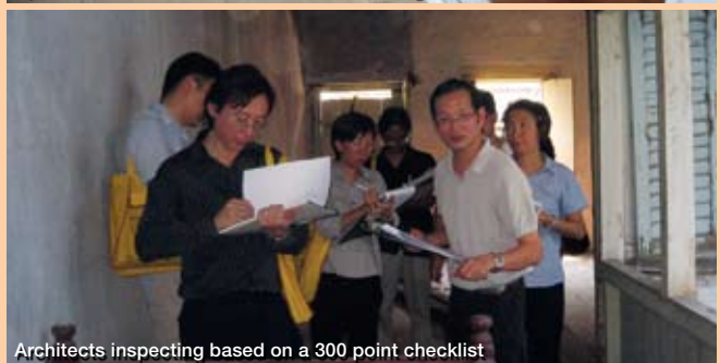
Architects inspecting based on a 300 point checklist