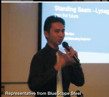
Representative from BlueScope Steel