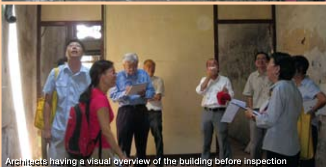
Architects having a visual overview of the building before inspection