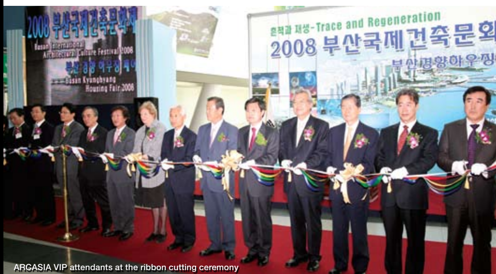
ARCASIA VIP attendants at the ribbon cutting ceremony

27 October 08 - 1 November 08 • Nurimaru APEC House/Westin Chosun, Busan, Korea.