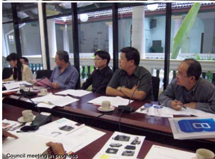
Council meeting in progress