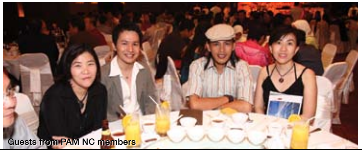
Guests from PAM NC members