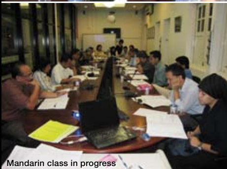
Mandarin class in progress