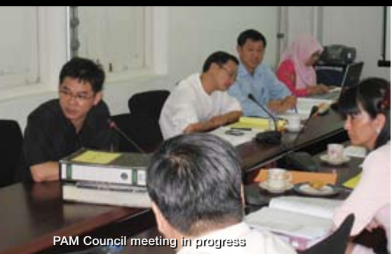
PAM Council meeting in progress