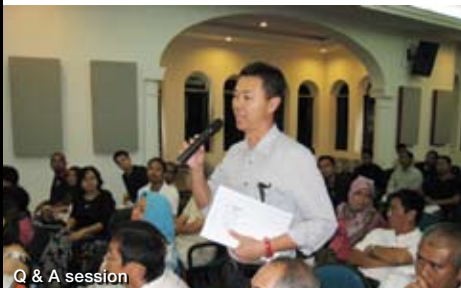
Q & A session

Every Tuesday from 30 October 07 - 4 March 08