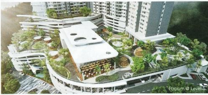
Podium @ Level 5