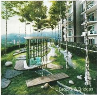
Brooks & Bridges