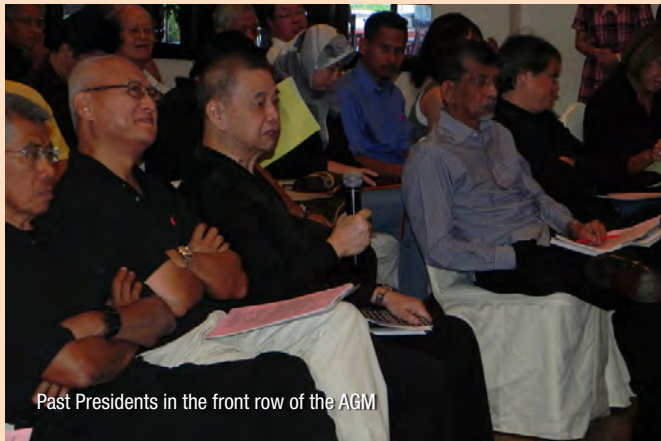
Past Presidents in the front row of the AGM