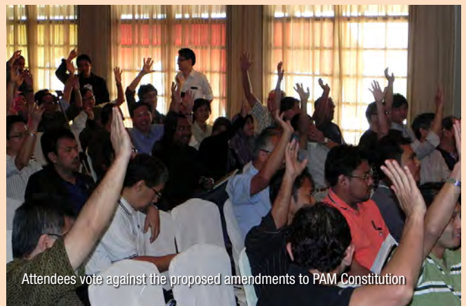
Attendees vote against the proposed amendments to PAM Constitution